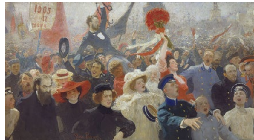
The painting 17th October 1905 by Ilya Yefimovich Repin.